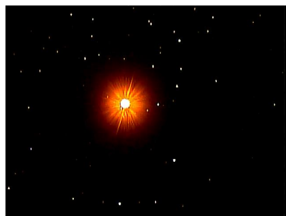
This image of the Herschel Garnet star in Cepheus was taken by Mark using a Mallincam Xterminator camera mounted on a Celestron 9.25 inch telescope