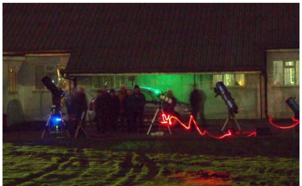
Village hall by “night vision”