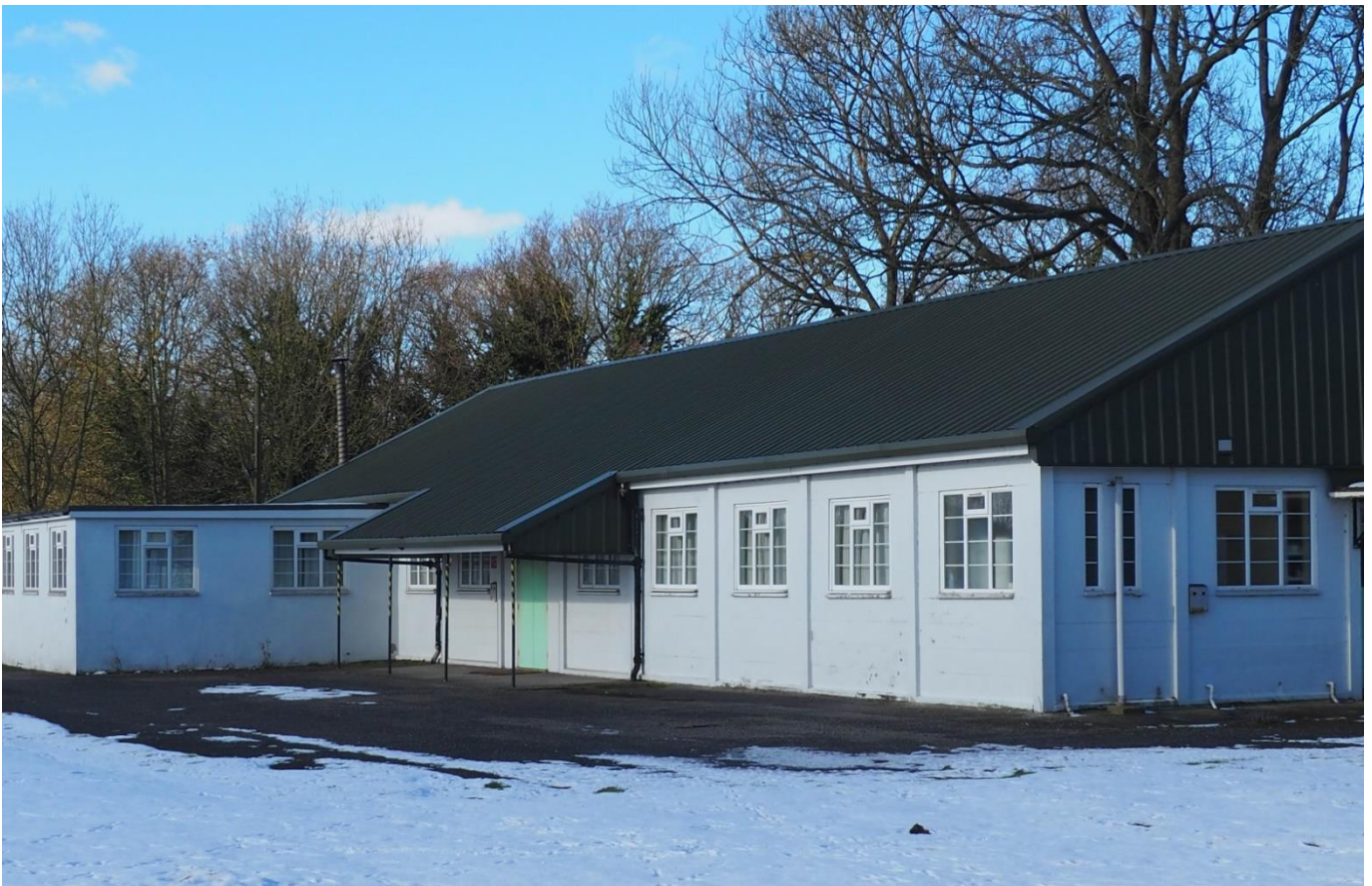
Woodmansey Village Hall January 2021 (not used during the pandemic)

Our usual meeting and observing site is Woodmansey Village Hall, a surprisingly dark site between Beverley and north Hull with easy road access and ample parking. After the end of the pandemic we will again meet here on the 1 st Monday of each month excluding June and July.