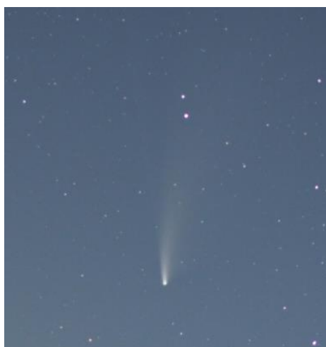
Comet Neowise photographed by Lee in early 2020 with a simple digital camera and "barn door" set up.

We have a number of members who are developing their interest in astrophotography, while others are keen to view the skies with their own eyes, with the aid of binoculars or a 12" scope.